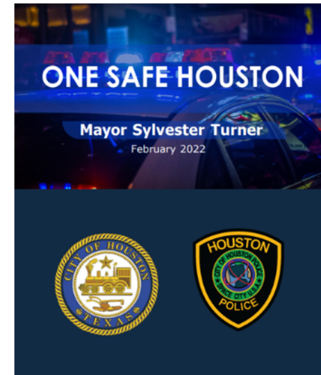
MAYOR'S PUBLIC SAFETY INITIATIVE TO COMBAT VIOLENT CRIME